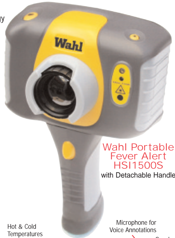
Wahl Portable Fever Alert HSI1500S with Detachable Handle

Low cost and ease of use make the Portable Fever Alert the best choice to use to potentially minimize the spread of influenza in public venue's.